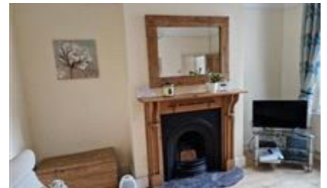
First floor front room £495 pcm

Fully furnished double ground floor room in a highly professional house share, located in the popular area of Hoole centre. Hoole is situated within easy walking distance of Chester city centre and offers an impressive range of amenities.